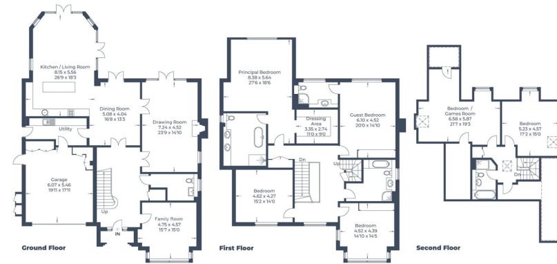
Illustration for identification purposes only, measurements are approximate, not to scale. © Property Marketing Produced for EXP Steve Rosenthal

Approximate Gross Internal Area Ground Floor = 198.6 sq m / 2,134 sq ft First Floor = 181.2 sq m / 1,950 sq ft Second Floor = 97.2 sq m / 1,046 sq ft Total = 477.0 sq m / 5,130 sq ft